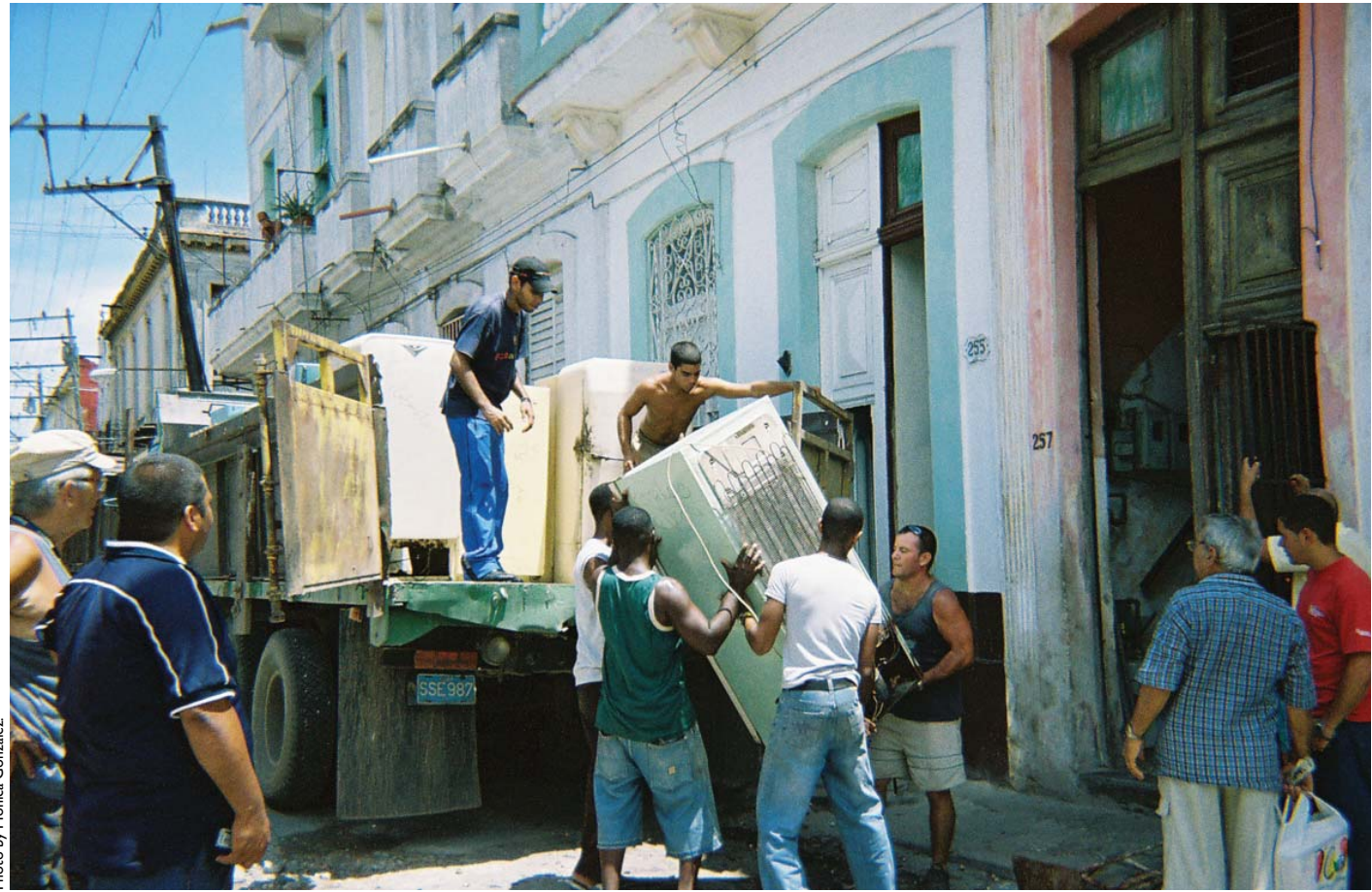
"Vintage" refrigerators are loaded onto a truck.

Most families living in Plaza, a neighborhood flanking the epic Plaza de la Revolución in Havana, will remember August 25, 2007, as the day they had to say good-bye to their cherished General Motors, Westinghouse and Minsk refrigerators which arrived on the island from the U.S. in the 1950s and from the U.S.S.R. in the 1970s.