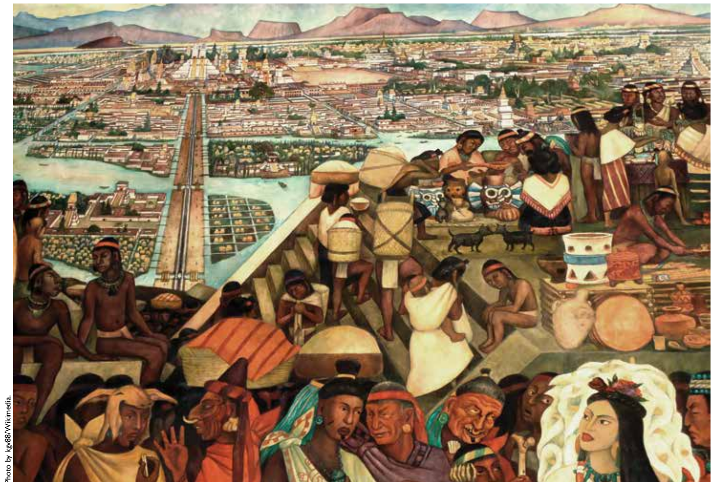
Detail of Diego Rivera's mural of Aztec city life at Mexico's Palacio Nacional.