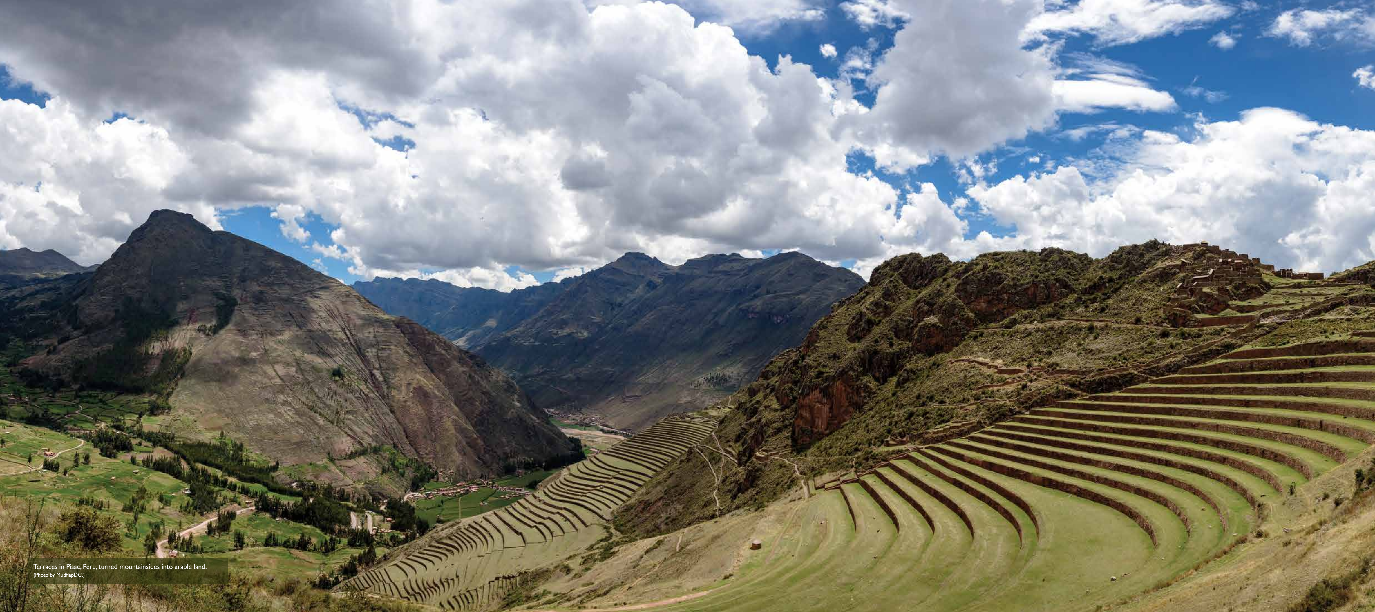
Terraces in Pisac, Peru, turned mountainsides into arable land.