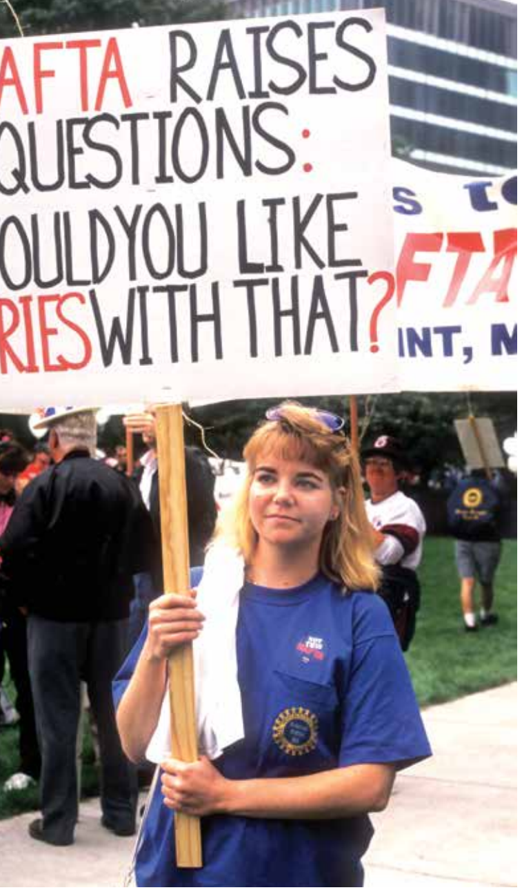
A protester questions the quality of jobs created under Nafta.

What happened to the promise of Nafta? In terms of economic integration, the agreement created two very different North Americas as the business climate improved, while labor standards deteriorated. For investors and corporations, Mexico has become comparable to Ohio minus the tough winters — while for