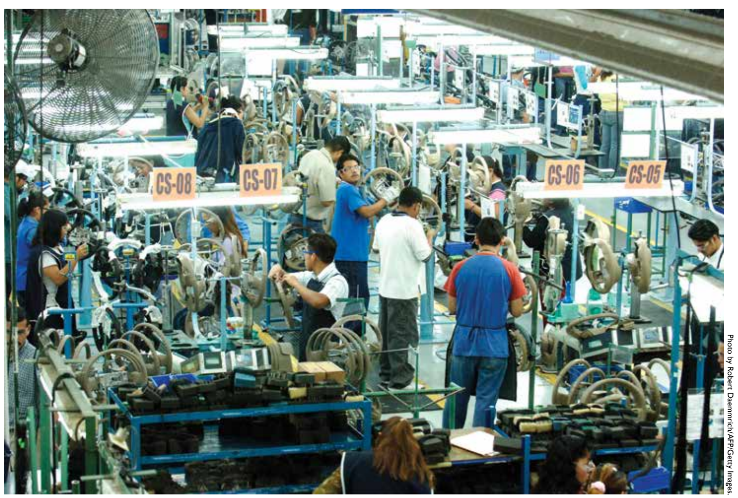
This busy Delphi auto parts plant produces steering wheels in Matamoros, Mexico.

— and median hourly real compensation for workers fell 13 percent, widening a severe long-term gap.