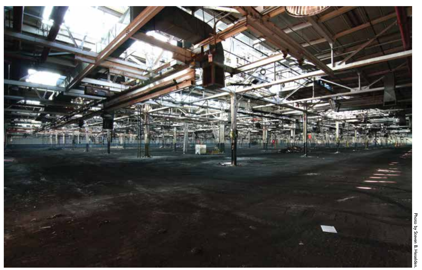
This abandoned Delphi plant in Columbus, Ohio, was replaced by a casino.

benefit from lower prices as a result of these arrangements. Not necessarily. The "savings" are more likely to go into increased corporate profits and stratospheric executive salaries; automakers hardly offer a North American "discount" on vehicles produced in Mexico.