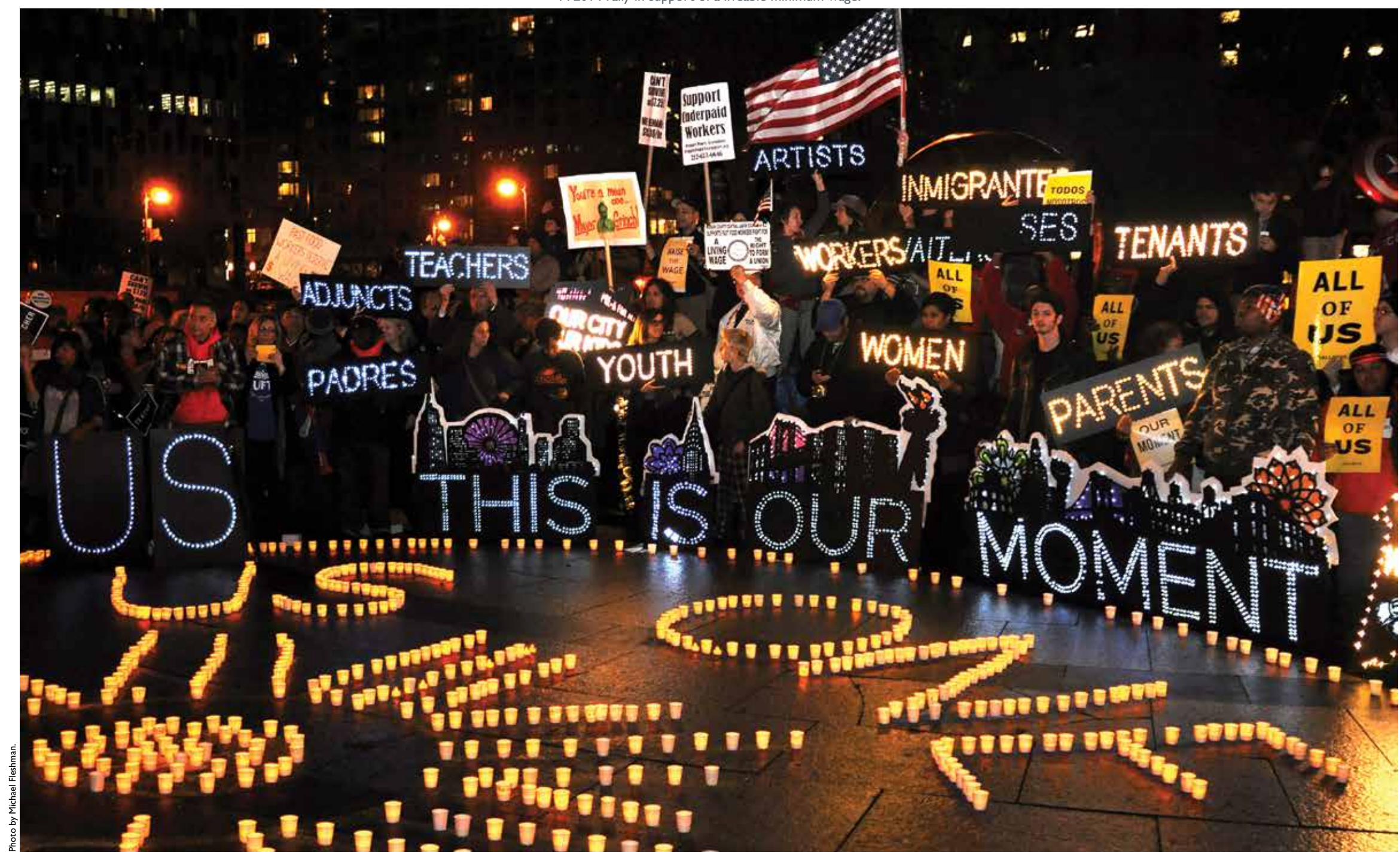
CENTER FOR LATIN AMERICAN STUDIES, UC BERKELEY

To realize the benefits of trade for workers, their families, and their communities — a broadly shared A 2014 rally in support of a liveable minimum wage.