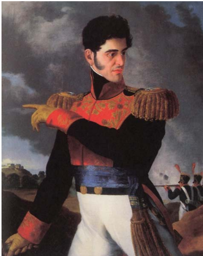
Painting by Carlos Paris.