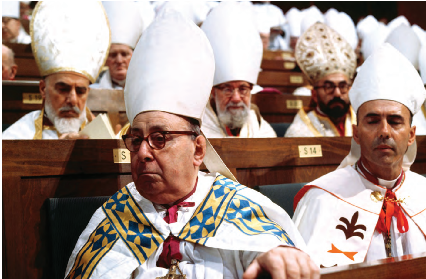
The Second Vatican Council (Vatican II) in 1962.

military dictatorships in South America in the 1970s and 1980s. At the 1968 Medellín Conference of Latin American bishops, liberation theologians took their message further into what this might mean in terms of everyday pastoral practice. The bishops pledged themselves to a new spiritual/social contract called a “preferential option for the poor,” which required the Latin American Church to detach itself from its colonial moorings and its favoritism toward the power elites, the landowning and industrial classes. The practitioners of liberation theology called for the growth of “ecclesiastical base communities” in favelas , poor barrios , and shantytowns where Catholic clergy and nuns working closely with lay people would read and discuss the scriptures as political as well as theological texts. Poverty and hunger were recast as “structural violence” and as social sins to be challenged and expunged. Liberation theology reconciled Christianity and social Marxism at a time when right-wing dictators overthrew democratic socialist political leaders with the help of the CIA and the U.S. Congress.