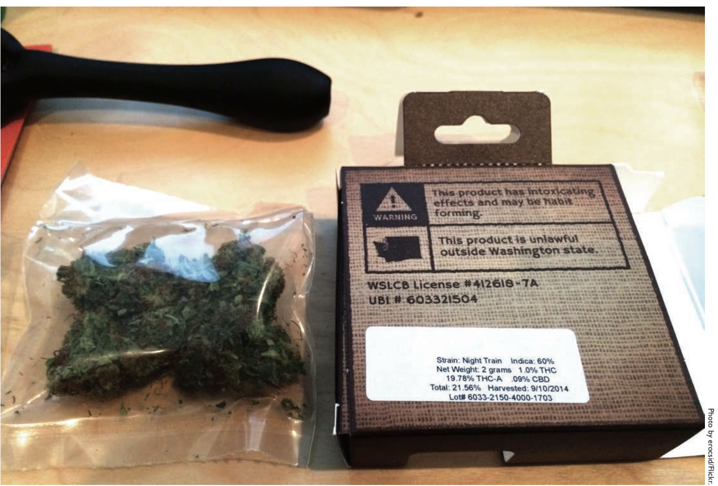
Prepackaged and labeled marijuana in Washington.

The "10 Ps" of Marijuana Legalization 57