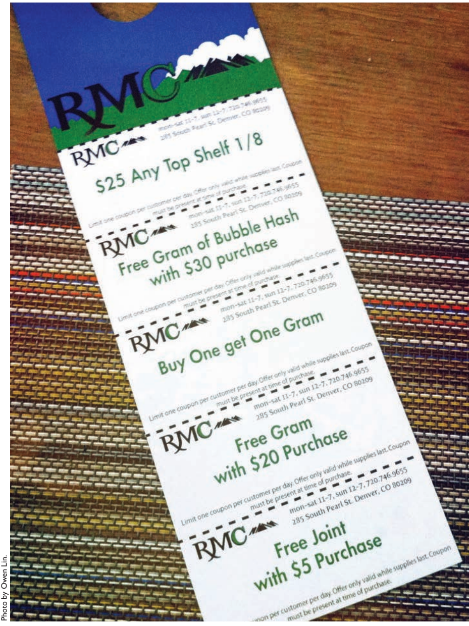
A door hanger with coupons for the purchase of marijuana in Denver, Colorado.

Decisions also need to be made about how production violations will